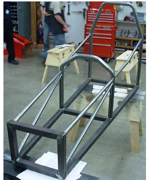
The frame of the car at the beginning with only four supports.

As time went on, everything was getting done faster and it seemed like everything was getting easier to complete. We finished welding the supports on the frame, and some of the measurements on the supports were off. In order to fix this, we had to take more time to measure and