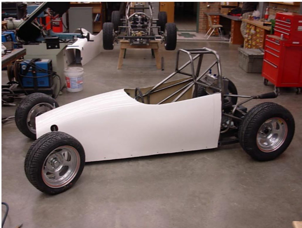
Our car as of January 15th, 2010