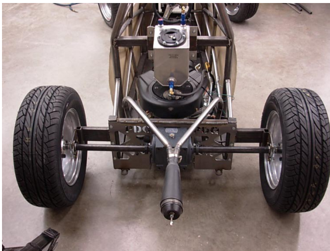
Rear axle, with the exhaust, gear box, muffler, and back plate.