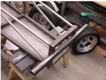
The front end, not welded on, when we didn't have the necessary parts.